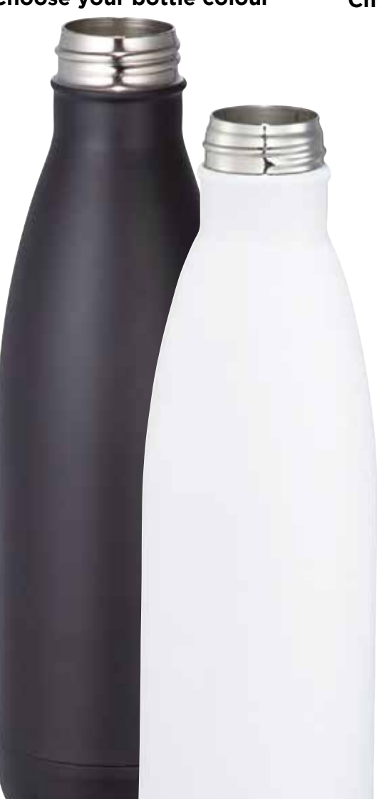
4087 Copper Vacuum Insulated Bottle

Eco friendly drink bottle is double wall 18/8 grade stainless steel with vacuum insulation. Inner wall is plated with copper for ultimate conductivity to keep drinks hot for 12 hours and cold for 48 hours. 500ml capacity. Available in 7 colours.